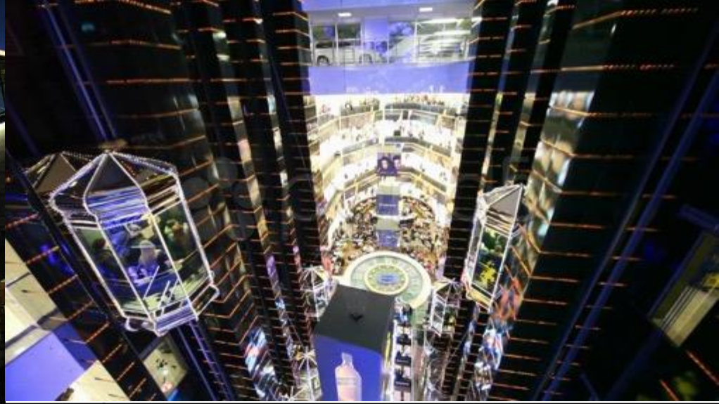
Old Arbat Street